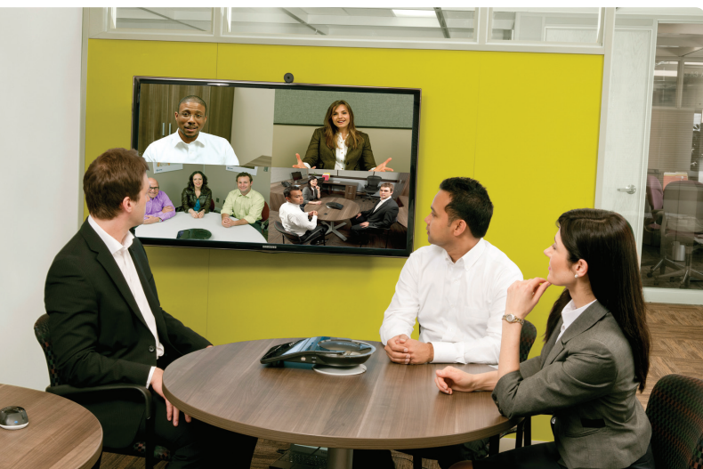
Mitel UC360™ Next Generation Collaboration